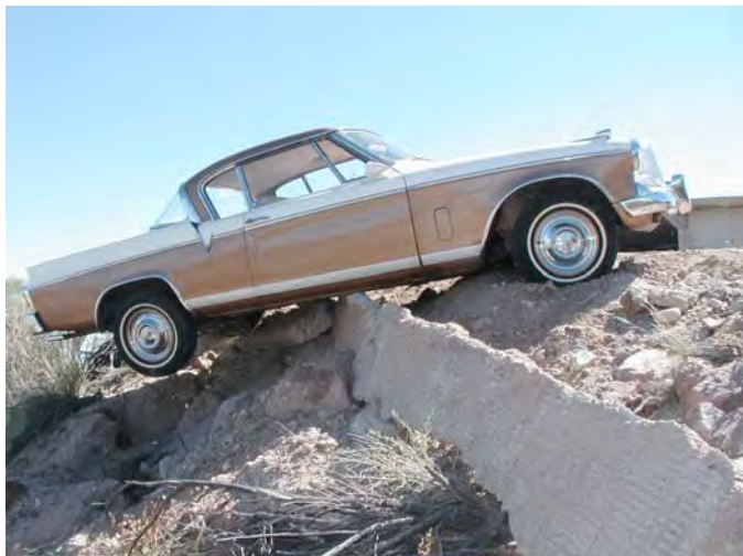
Dude! Where's my Stude?

From where it was, I first thought was that someone tried to steal it and ran it off the edge. As we had other cars parked in the carport with keys in them, why would anyone want to steal a Studebaker?