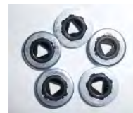
Pressure sealing washers

I bought the McMaster Carr 93781A011 pressure sealing washers direct (for the gas tank sending unit).