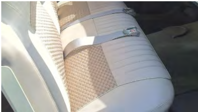
This photo shows the incorrect front seat pattern with the vinyl section separating the bottom insert.