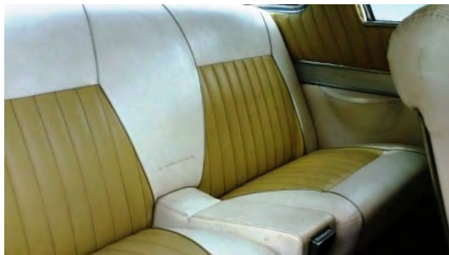
You can see how one might think the front seat should match the rear.