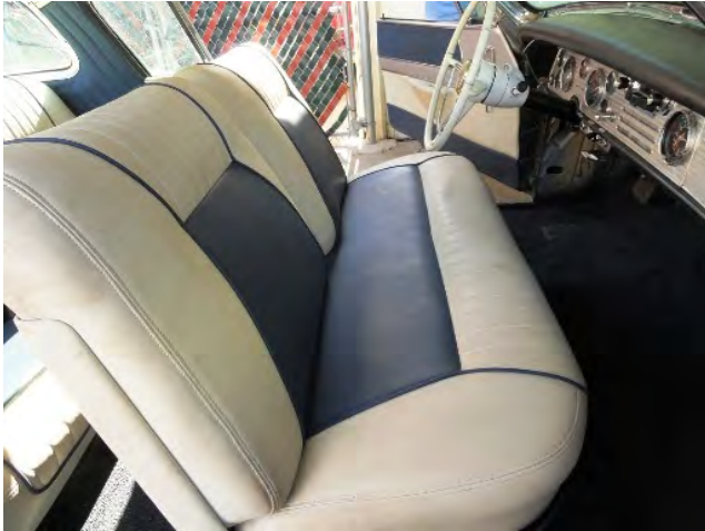
Correct: seat bottom insert goes completely across and between the side bolsters

assume that something is correct just because my cars are that way. Below are samples of the incorrect and correct seats: