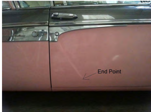
1955 Speedster With The Replacement Door Part # 310606 & 310607