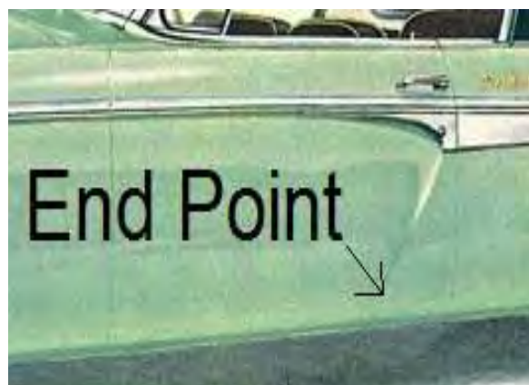
1955 Champion, Commander & President State Part #s 308812 & 308813

The Speedster door (and maybe all '55 doors) also carried a different part number as it had an additional cutout on the inner frame for the ashtray."