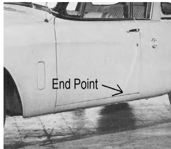
1953 - 1954 Champion, Commander, Starliner Part # 302982 & 302983

substitute for the 53-55 models. I am pretty sure the mounting holes are the difference – we'll double check to make sure. According to our records, the Speedster used the long-scallop door – I refer to the attached photographs, both factory and restored.