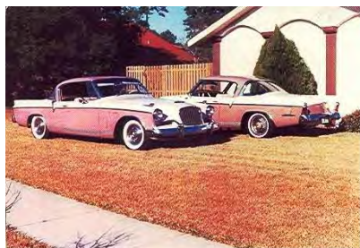
Which Twin Has The Tach?

Yes, to my left sat the car I should have been sitting in. I'm not sure if I was in the correct car on any of my other attempts, but I'm hoping I was every time. I took this as a sign that I was not destined to replace that tach. I took the car to an electrical shop and