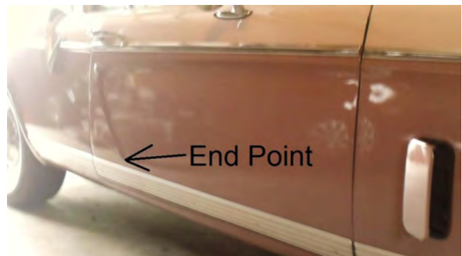
1956 Flight Hawk Hardtop, Sky Hawk & Golden Hawk Part # 1314668 & 1314669