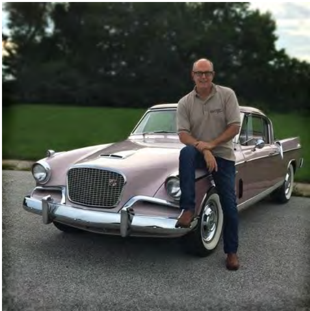
I hope this photo does not make you sad.

My granddaughter LOVES the 56J. All exterior bright work has been redone. Hood repainted, rechromed front grill, wheel covers buffed and decaled, etc.