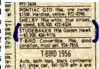
This is the ad in the Atlanta paper.