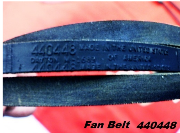
Fan Belt 440448

Jim wrote, "Most definitely were marked!! The fan belt has the Packard p/n "molded on" the outer cover. The P/Steering belt has the Studebaker p/n "ink-stamped" on the outer cover. Refer to my photos below:"