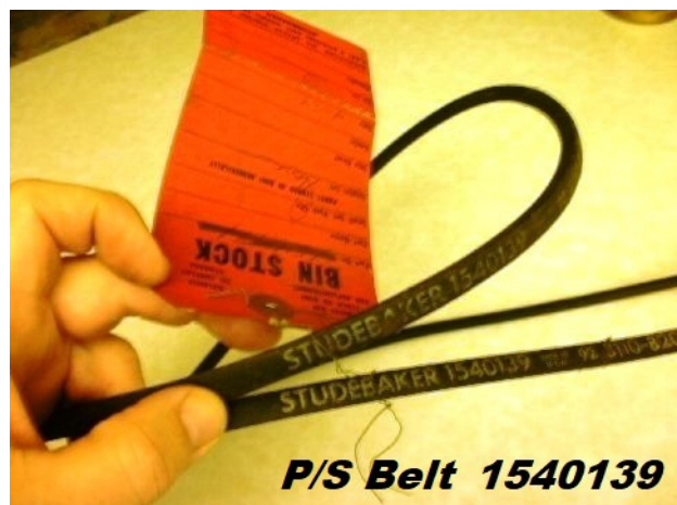
P/S Belt 1540139

V-belt manufacturers using a molded outer wrap would simply mold the information right on the belt,