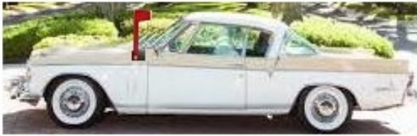
Letters From Our Readers. (Edited as required.)